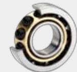
Bronze ball guided cage