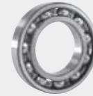
Steel ball guided cage